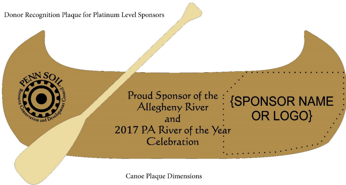
Canoe Plaque Dimensions

Overall size including paddle: 16x8.5" Canoe size: 16x6" Thickness Canoe: 3/8" Paddle 1/4"